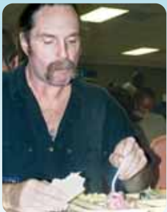
A meal is the beginning of a new life for Open Door Mission clients.